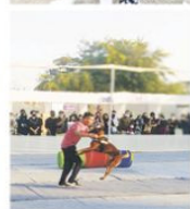
'Winter Fest' for pets and families organized by the Society for the Prevention of Cruelty to Animals (SPCA) at Dimapur Government College ground on November 27.