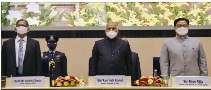
President Ram Nath Kovind (C) with Chief Justice of India Justice N.V. Ramana (L) and Union Minister for Law and Justice Kiren Rijju (R) during the valedictory ceremony of the 'Constitution Day' celebrations, organised by the Supreme Court, in New Delhi, Saturday, Nov. 27, 2021.

"Another issue is that the legislature does not conduct studies or assess the impact of the laws that it passes. This sometimes leads to big issues. The introduction of Section 138 of the Negotiable Instruments Act is an example of this. Now, the