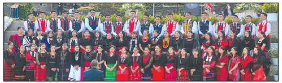
Japfü Christian college choir during the flag hoisting at the 25th anniversary celebration of Japfü Christian College held on November 27.

"There is little or no integration of biblical clue and Christian thinking in the subjects that are taught in the curriculum. Subjects are