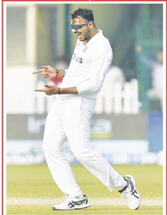
Indian bowler Axar Patel celebrates the dismissal of New Zealand batsman Tom Blundell during third day of the first Test cricket match between India and New Zealand, at Green Park stadium in Kanpur on November 27.