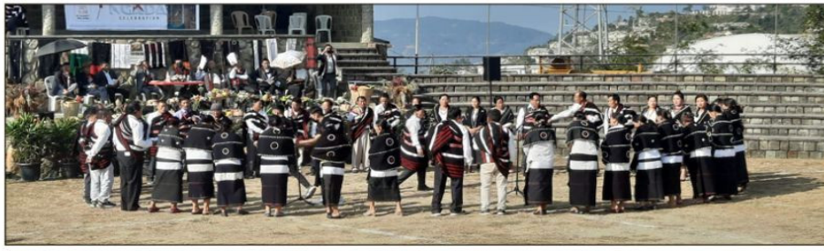
Remnga Public Organization Kohima organized its annual general session cum Ngada celebration 2021 (Mini-Hornbill Festival) at Naga Solidarity Park, Kohima on November 27.

KOHIMA, NOVEMBER 27 (MEXN): The Remnga Public Organization Kohima (RPOK) organized its annual general session cum Ngada celebration 2021 (Mini-Hornbill Festival) at Naga Solidarity Park, Kohima on November 27.