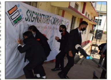
Students taking part during the signature campaign at Wokha on November 27.

Selemia also said that election is a process where the people elect their representatives to form a Government, thereby making elections one of the most important pillars in a democratic country. The success and failure of election in a democratic country depends on responsible citizens who should try to maintain a clean electoral roll, she added.