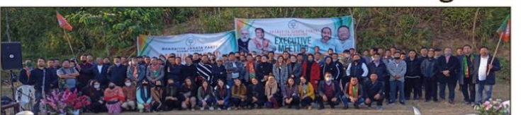
Dignitaries and members of BJP Kohima district during the executive meeting on November 24.

KOHIMA, NOVEMBER 27 (MEXN): The BJP Kohima district conducted its district executive meeting-cum-annual picnic at the Nagaland State Bharat Scouts & Guides Training Centre, Nerhema in Kohima district on November 24 last.