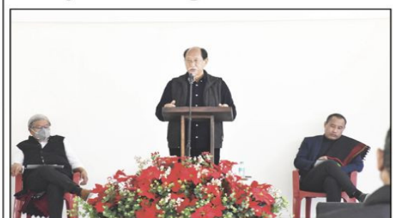
CM Neiphiu Rio speaking at Kohima DPDB Day Out cum Pre-Christmas held at Dzuii Resort, Ruisoma on November 27.

KOHIMA, NOVEMBER 27 (MEXN): Nagaland Chief Minister, Neiphiu Rio said the officers posted in the state capital have to contribute not only for their departments but to contribute towards all round development of the capital town. He said this while addressing the Kohima District Planning and Development Board (DPDB) day out cum Pre-Christmas held at Dzuii Resort, Ruisoma on November 27.