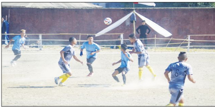
DEF Tsg in grey jersey vs Excel Naga in blue jersey in the 1st match of the TDFA Cup at the parade ground, Tuensang on November 27.