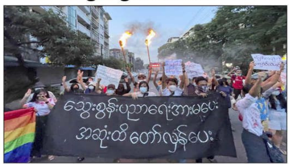
A small group of protesters hold a banner which reads in Burmese "Do not support the bloody education, revolt until the end" while calling for a boycott of the education system under the military government that ousted Myanmar leader Aung San Suu Kyi during a flash mob rally in Tarmwe township in Yangon, Myanmar, Wednesday, Nov. 10, 2021.

statement -- the U.S., Australia, Canada, New Zealand, Norway, South Korea and the United Kingdom -- already have embargoed arms sales to Myanmar, whose army seized power from the elected government of Aung San Suu Kyi in February. They also have instituted targeted diplomatic and economic sanctions meant to