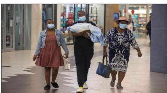
People with masks walk at a shopping mall in Johannesburg, South Africa, Friday Nov. 26, 2021. Advisers to the World Health Organization are holding a special session Friday to flesh out information about a worrying new variant of the coronavirus that has emerged in South Africa, though its impact on COVID-19 vaccines may not be known for weeks.

From just over 200 new confirmed cases per day in recent weeks, South Africa saw the number of new daily cases rocket to 2,465 on Thursday. Struggling to explain the sudden rise in cases, scientists studied virus samples from the outbreak and discovered the