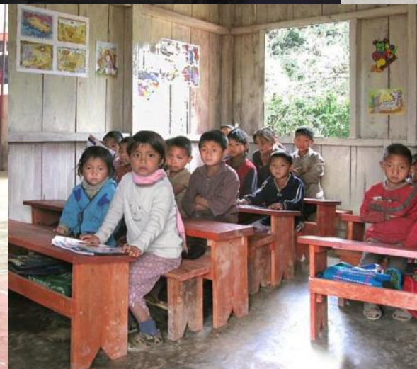
Present and future scholars