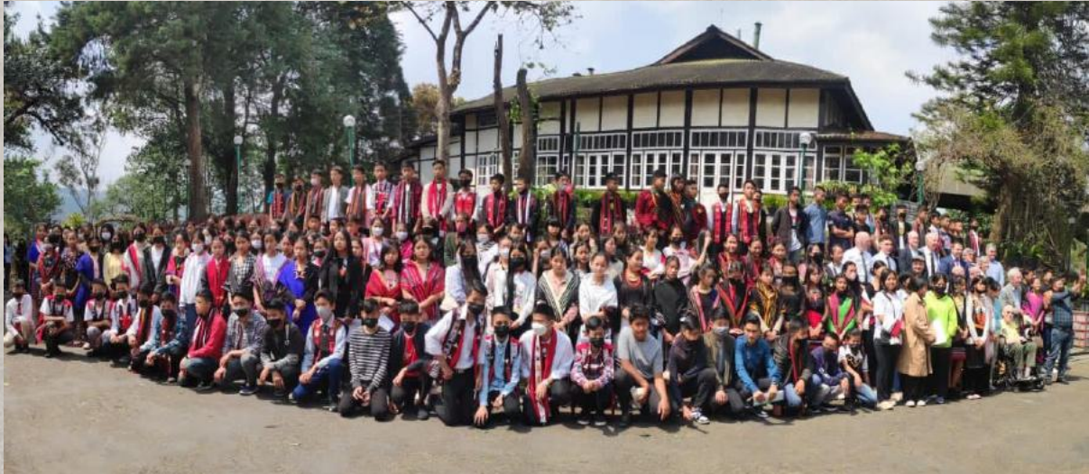
Kohima Educational Trust scholars, 2022

The Kohima Educational Trust - Using the past to benefit the future: